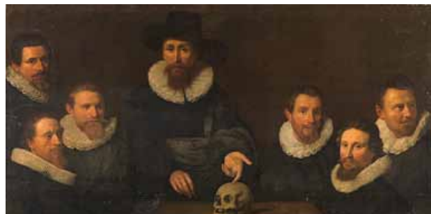
Figure 4. The anatomy lesson of Dr. Johan Fonteijn. Painting by Nicolaes Elias, 1625/26. Amsterdam Historical Museum.