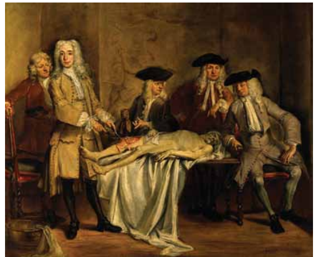
Figure 9. The anatomy lesson of Dr. Willem Roëll. Painting by Cornelis Troost, 1728. Amsterdam Historical Museum