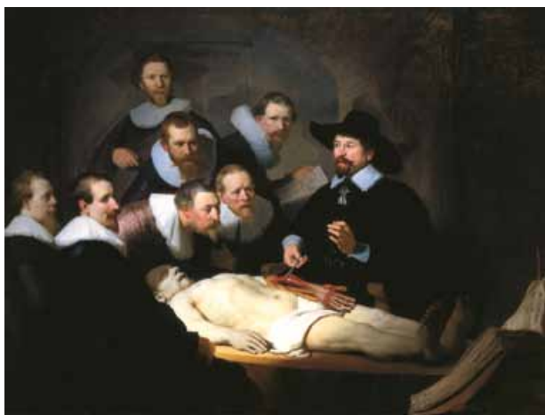
Figure 5. The anatomy lesson of Dr. Nicolaes Tulp. Painting by Rembrandt van Rijn, 1632. The Hague, Mauritshuis.

The reknowned Rembrandt van Rijn painted “The anatomy lesson of Dr. Nicolaes Tulp” in 1632 (Figure 5). Nicolaes Tulp (1593-1674) was originally trained non-academically as a surgeon, but after finishing the Latin School in Amsterdam he studied medicine at Leyden University. In 1614, he graduated with a dissertation “De cholera humida” and became a general practitioner in Amsterdam. In 1628 he was appointed “praelector anatomiae” of the Amsterdam Guild of Surgeons, while in 1622 he became an alderman and in 1653 mayor of Amsterdam. In 1641 he published his famous “Observationes medicae” [19]. In the painting, he demonstrates the dissection of the flexors of the forearm on the corpse of an executed criminal. Dr. Tulp holds forceps in his right hand, with which he is demonstrating a muscle. The identification of this muscle is a matter of dispute [20-22], which, along with other presumed mistakes in the anatomy of the dissected forearm in this masterpiece, has been discussed in medical and art-history literature for decades, in spite of which there is still no general consensus about the structures depicted in the forearm [20-22]. While most