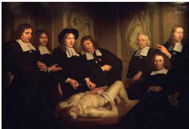
Figure 7. The anatomy lesson of Professor Frederik Ruijsch. Painting by Adriaen Backer, 1670. Amsterdam Historical Museum.

“The anatomy lesson of Professor Petrus Camper” by Tibout Regters was finished in 1758 (Figure 10). The “praelector anatomiae” demonstrates on a head and neck specimen a dissection of the neck muscles and nerves. The composition is