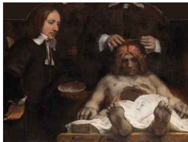
Figure 6. The anatomy lesson of Dr. Johannes Deijman. Painting by Rembrandt van Rijn, 1656. Amsterdam Historical Museum.

In 1656 Rembrandt van Rijn painted another lesson, “The anatomy lesson of Dr. Johannes Deijman” (Figure 6). The “praelector anatomiae”, of whom only his hands are visible, is demonstrating the meninges in a brain dissection. The instrument he is using is probably forceps or a probe. The surgeon and “collegiemeester” (assistant to the “praelector”) Gijsbert Calkoen, is watching the dissection and holds a part of the skull in his left hand [17]. The abdomen has been dissected previously. Between the “praelector” and Calkoen the lower part of another person is vaguely visible. The depiction of the position of the body is similar to that in Andrea Mantegna’s “The Lamentation” [23]. The painting in its present state is only a fragment, but a drawing of the original painting, probably placed in the guild room later than 1656, gives some idea of what it was originally like [23]. In the original painting two other persons were present on the left of Calkoen, and on the left of Deijman another three. This drawing also gives an indication of the theater, because a gallery is visible.