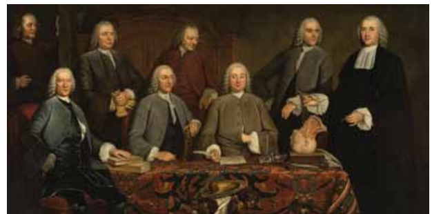
Figure 10. The anatomy lesson of Prof. Petrus Camper. Painting by Tibout Regters, 1758. Amsterdam Historical Museum.